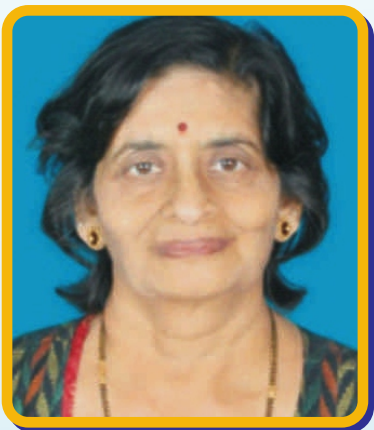
Smt. Shobhana Paranjpye